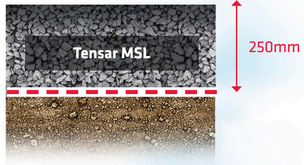
Tensar MSL designed to carry predicted traffic load

Performance based value with a Tensar MSL (mechanically stabilised layer)