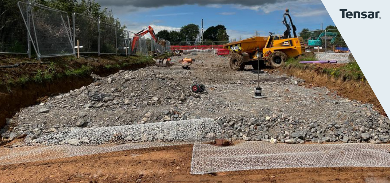
Single MSL (mechanically stabilised layer) delivering a bespoke solution and significant savings